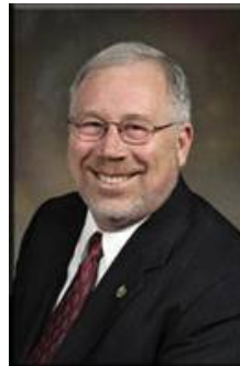
Luther Olsen State Senator