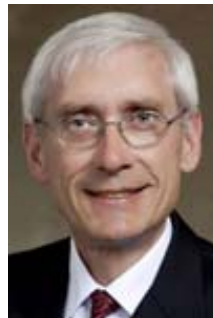
Tony Evers Superintendent